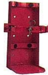
20 LB. PART #G20

2-1/2 lb. FITS MOST POPULAR 2-1/2 LB. DRY CHEMICAL FIRE EXTINGUISHERS